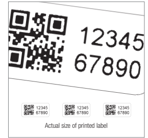
Ultra-high 600 x 1200dpi resolution using a microstep drive control system