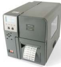
DESIGN/TEC/UK - JN 734