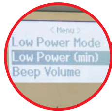
User-friendly and informative large LCD read-out