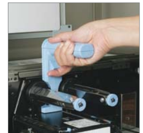
Vertical lifting head unit for easy access