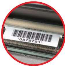
Amazing peel-off model performs on labels just 10mm high