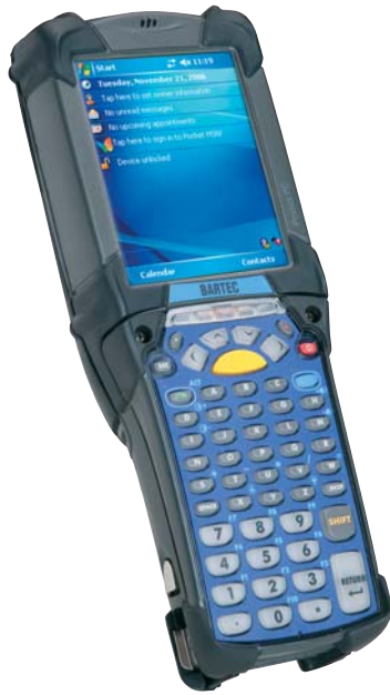
MC 9090 ex -K with 1D-/2D-Imager Engine